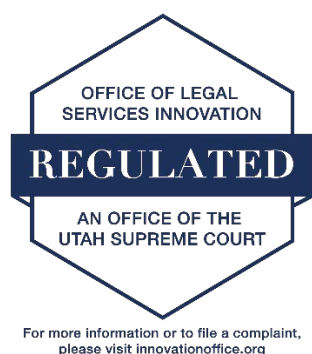
Figure 1. Utah Office of Legal Services Innovation

This will facilitate consumer knowledge and confidence and will provide question / complaint information. Regulators in Utah and the UK have developed a similar “badge” for regulated legal service entities. See examples below.